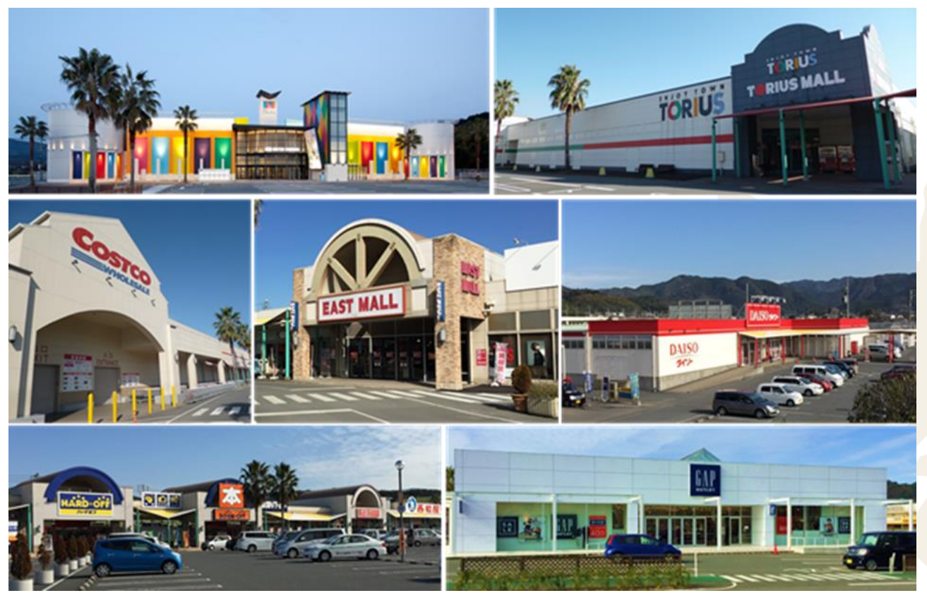
The diversified tenant mix of Torius Property